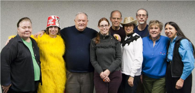
12/09 HCAFA Executive Committee Holiday Party