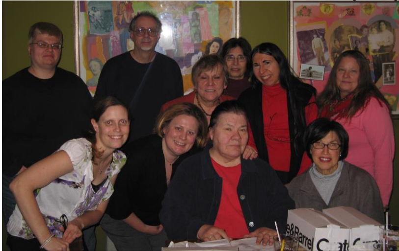
7/12 HCAFA & College Negotiating Teams & 3 rd Contract