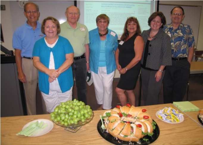
8/13 HCAFA Welcome Reception