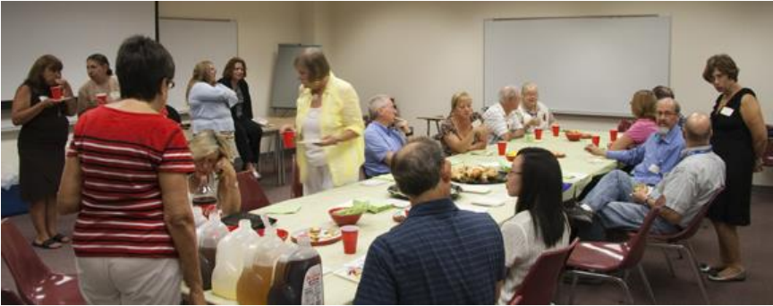
8/12 HCAFA Welcome Reception