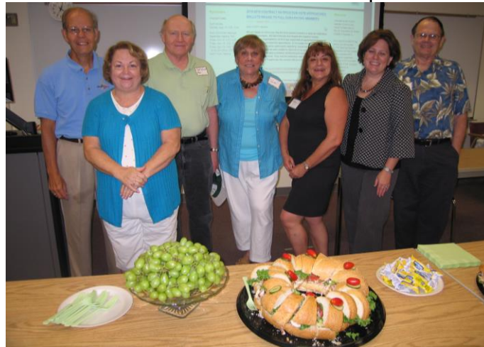
8/13 HCAFA Welcome Reception