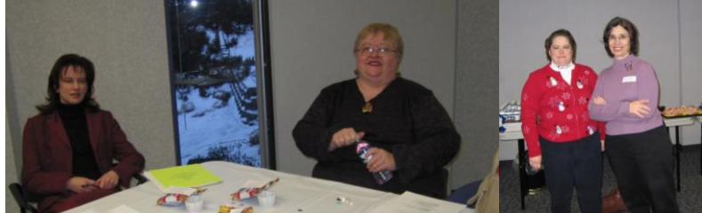
11/06 Protesting at Harper College Board Meeting