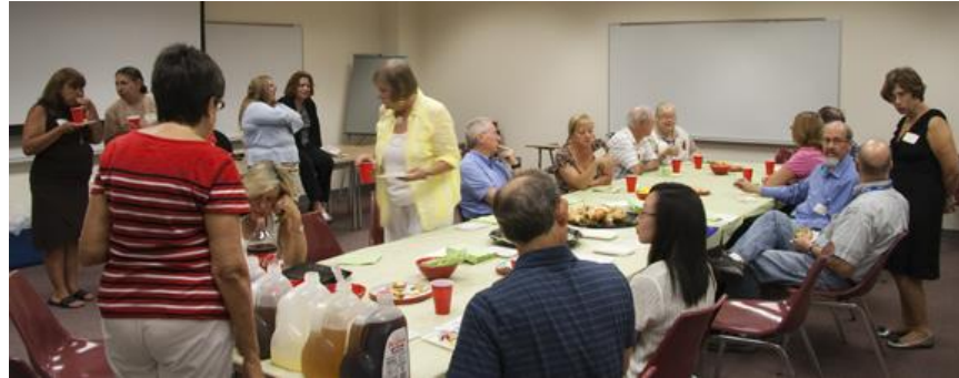
8/12 HCAFA Welcome Reception